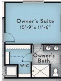
Large Closet Owners Suite