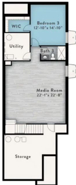
Finished Basement Option