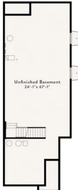
Unfinished Basement Option