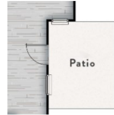
Side Patio Near Living Room