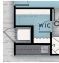
Entry Center Option