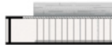
Stairs to Basement