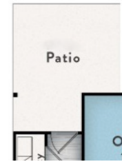
Large Patio Option