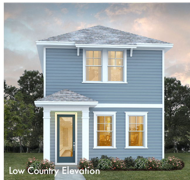
Low Country Elevation