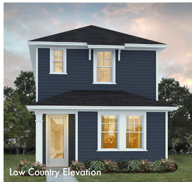
Low Country Elevation