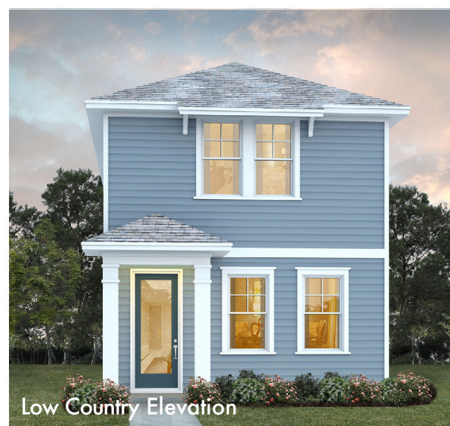
Low Country Elevation