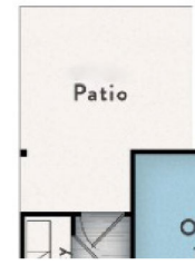
Large Patio Option