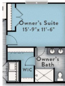
Second Closet Owners Suite