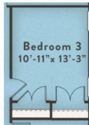
Bedroom 3 Closets