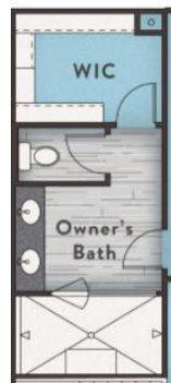
Luxe Owners Bath