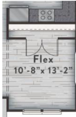
Flex Room Doors