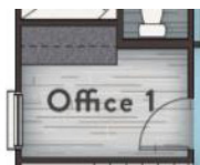
Office 1 ILO Loft