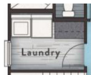
Laundry ILO Loft