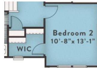
Bedroom 2 Walk-In Closet