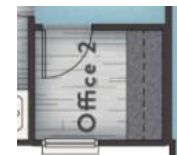
Office 2 ILO Laundry