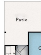
Large Patio Option