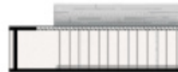
Stairs to Basement