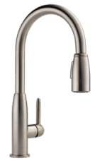
KITCHEN SINK PLUMBING FIXTURE