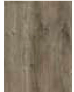
LUXURY VINYL TILE