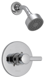
BATHROOM TUB AND SHOWER FIXTURES