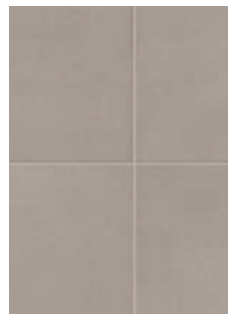
SHOWER WALL TILE