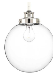
KITCHEN PENDANT LIGHT FIXTURES