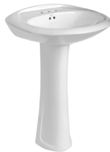
POWDER BATHROOM PEDESTAL SINK